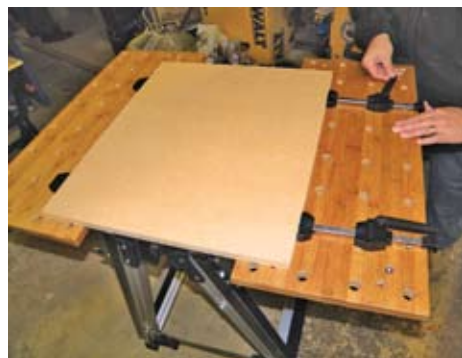
▲ In 'A' frame mode you get a large surface area for assembly or to clamp work to

If you look beyond the price and appreciate what you can do with a neat solution like this, the cost factor diminishes in favour of the demands of usefulness. 🛠️