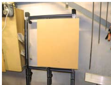
▲ With a panel in place you can clamp a guide rail directly to the Walko for easy cutting